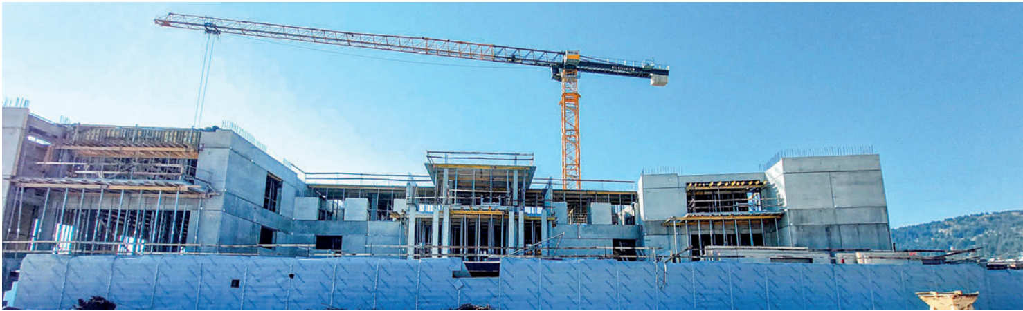
One of the biggest first projects, which has been built with the concrete elements was a Hotel in Gyergyóremete.

The new factory ensures that the challenges arising in the construction industry in terms of capacity, construction time and quality can be effectively handled with the most modern possible solutions. The production of precast products also serves this very purpose, with their help, construction costs and construction time are reduced and individual construction projects become much more efficient. ■