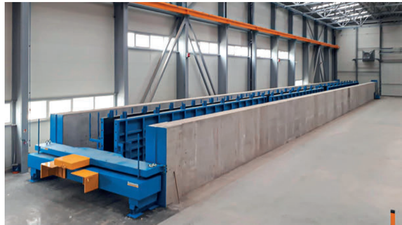
Viastein Kft. hall with the moulds for the production of columns, beams and stairs

The e pbos solution, which was especially developed for the precast concrete industry, functions as a higher-level ERP system and provides specific industry functions in order to support the business processes. From sales, project management, engineering to production, assembly planning, logistics and supply chain management, everything is perfectly integrated and managed in this central system. The complete project life cycles are constantly updated, making it easy to keep costs and time under control at all times. Real-time decisions can be made based on production, capacity, and costs.