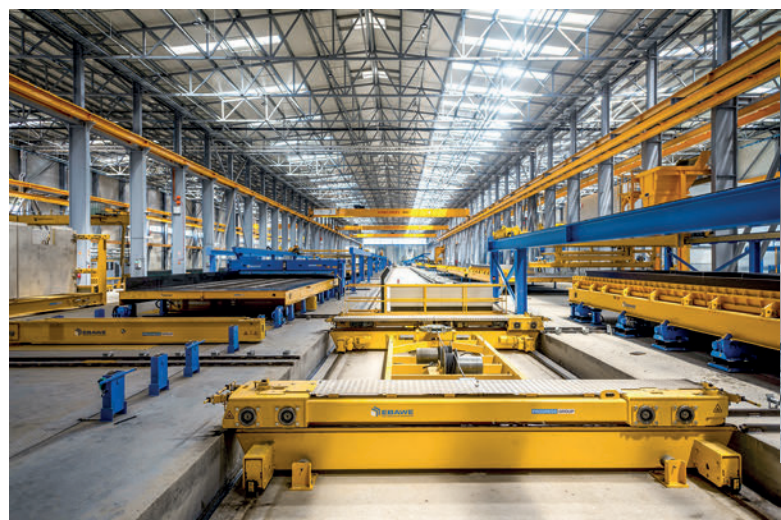
The new machinery from Progress provides an automated, more secure and cleaner production with higher quality products, made in a shorter amount of time.