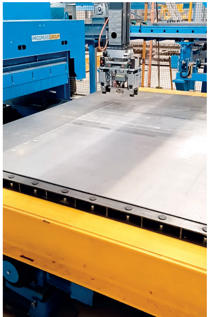
The marker for the placement of the shutters are made precisely with the help of the integrated software and fine lasers.

The production of precast elements consists of three essential parts: the rebar and mesh production, the software system and of course the carousel plant technology from Ebawe Anlagentechnik in which the pallet is circulating with the precast element and transporting it to the various steps of produc-