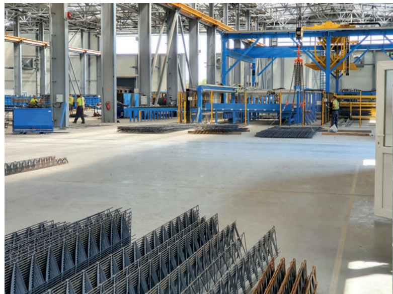
The production hall has 20.000 m 2 . With the different working stations more than one pallet can be worked on at the same time.

can provide complete solutions due to its various companies in the different fields. The machinery for the precast element production, the reinforcement production as well as the software has been delivered from this one source - the group companies Ebawe Anlagentechnik, Progress Maschinen & Automation, Tecnomcom and Progress Software Development. In addition to the sheer production methods also the produced elements are state-of-the-art licensed elements from Green Code. The system can provide a perfect indoor climate and additionally save energy while being the most efficient in heating and cooling as well as with highest air quality while also being acoustically optimized.