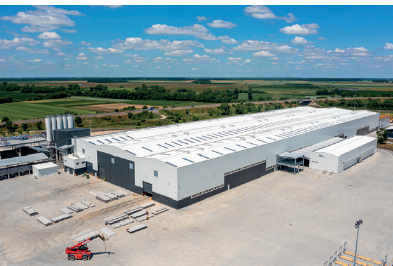
Viastein Kft belongs to the Bayer Construct group and is one of the biggest precast plants built in Hungary.

A precast plant as modern and automated as this one consists of many innovative machines working seamlessly together. In this case, the industry front runner chose another leader in its field for supplying the machinery and the relevant technology, the Progress Group. The company group