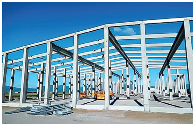
The beams and columns can be produced in the factory and then installed in no time at the construction site.