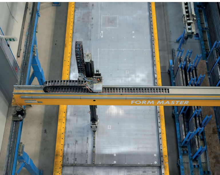
The shutters are placed exactly and automated according to the CAD planning.

ebos is part of the digital platform and together with e ® ebos®, guarantees a seamless vertical integration of all the business and production processes of Viastein Bayer across the different plants.