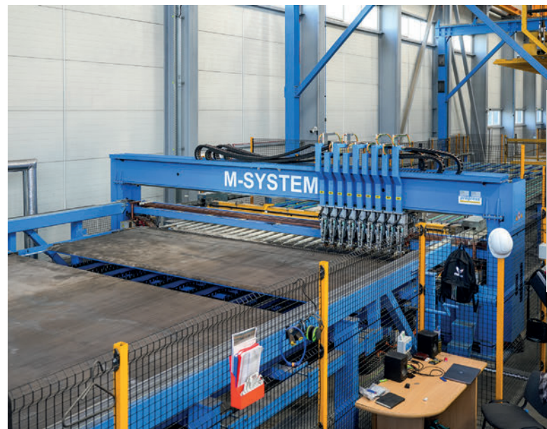
The M-System mesh welding plant is providing a high output with very high flexibility and automation and is producing directly from coil.