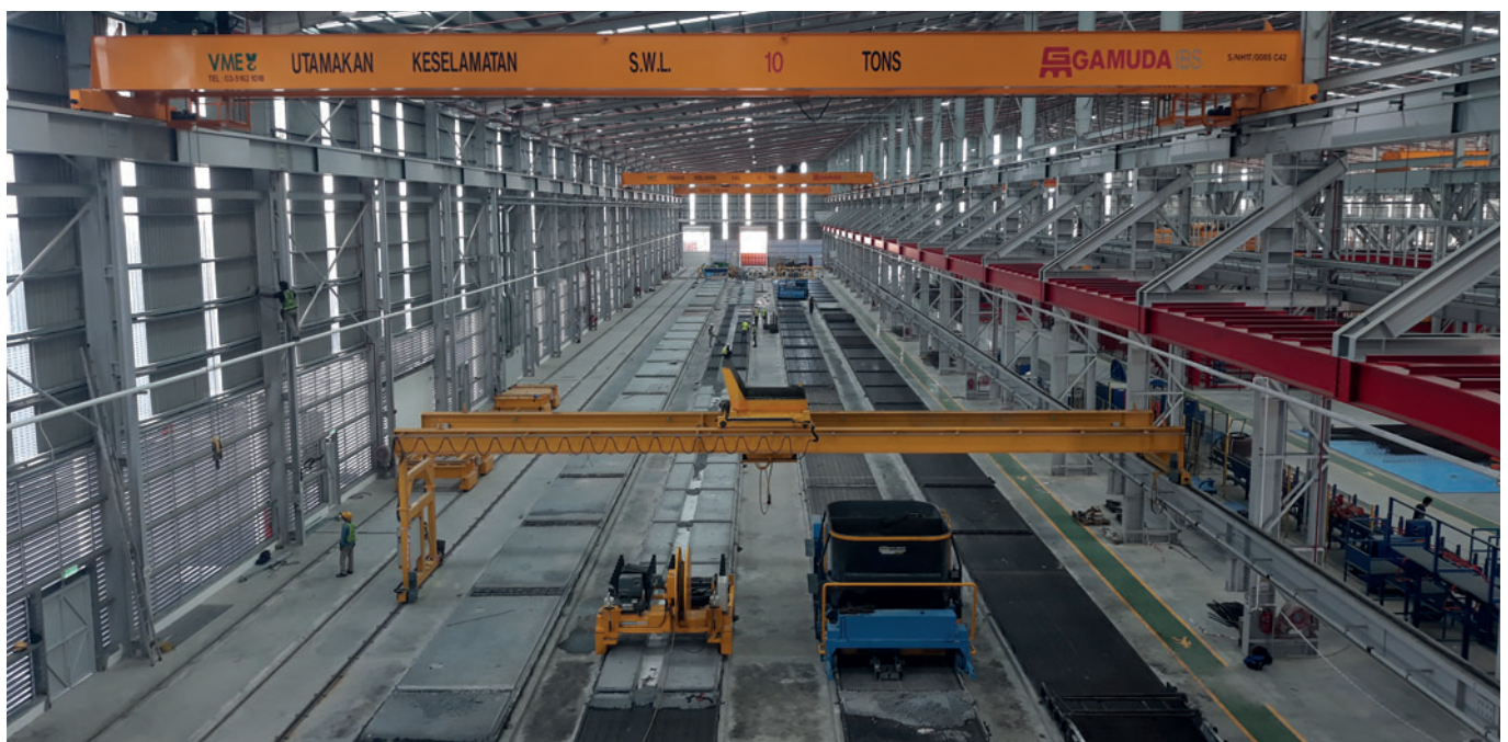
Echo has installed 4 production beds, each 150m long and 2,4 m wide and the Echo Slipformer S-Liner.

Ebawe supplied the equipment for the pallet circulation plant. Progress was responsible for the mesh and lattice girder weld-