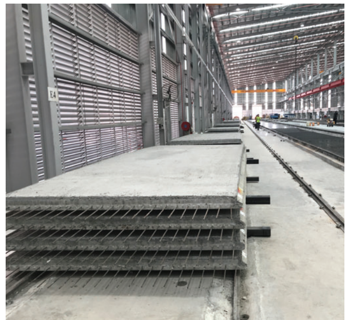
Gamuda can offer the pre-stressed concrete elements in thicknesses of 7 cm, 9 cm or 11 cm.