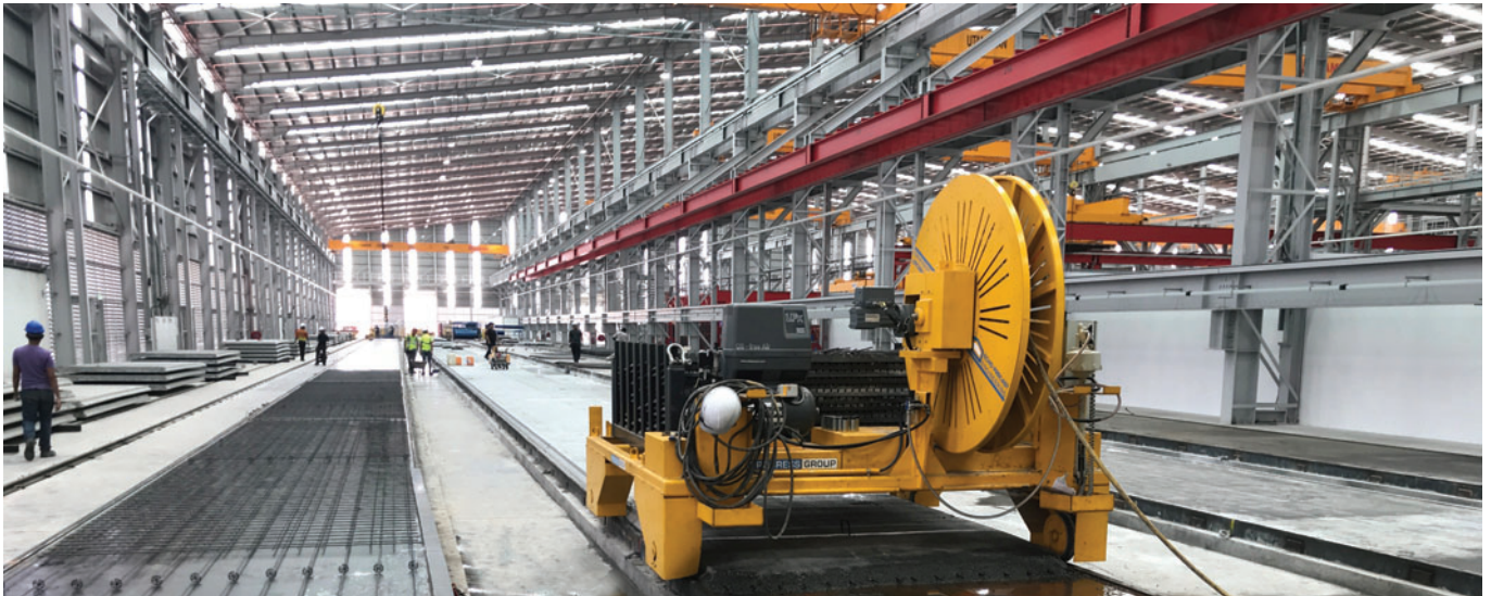
The expansion of the plant with the new production line for pre-stressed concrete elements was also developed by Prilhofer Consulting