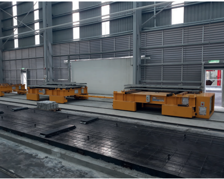
A novelty is the run-off carriage with a load capacity of 30 t.

and mould set. Changing to a completely different product can be completed even more quickly by replacing the production-related module.