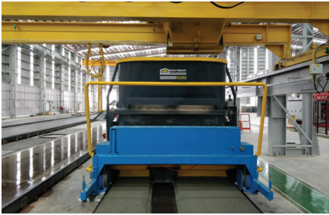
The possibility to produce 2 slabs at the same time with different widths (0,8 m and 1,20 m) stresses the flexibility of the Slipformer S-Liner.