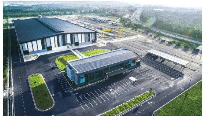
Gamuda has now expanded the plant and has invested in a production line for pre-stressed concrete elements.

The concrete plant commissioned in 2016 was developed by Prilhofer Consulting for an annual output of 1 million square metres of solid walls and precast slabs with in-situ topping