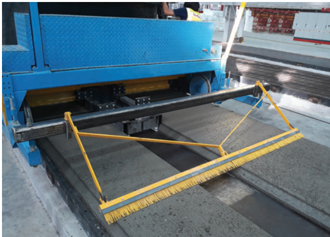
The Slipformer S-Liner from Echo Precast Engineering is a solution for versatile, flexible production requirements.

ing system, as well as all other reinforcement and mesh processing machines.